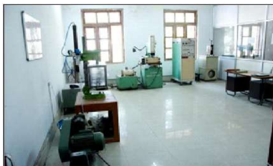
Non-Conventional Machining Lab.