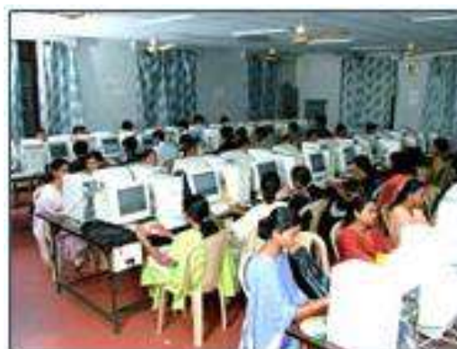
Linux Lab, MCA