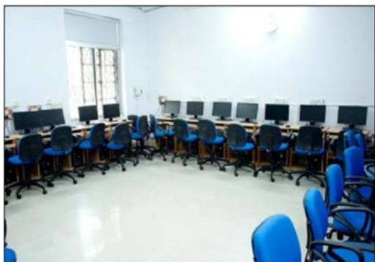
Windows Lab, MCA