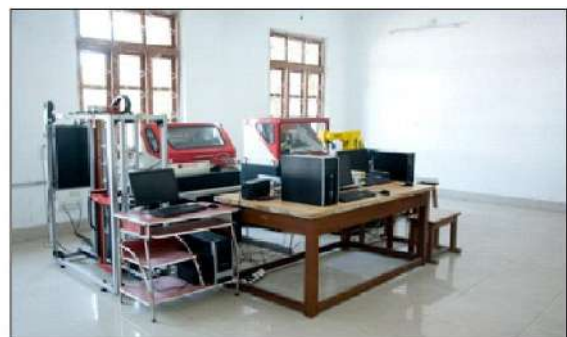
Robotics & FMS Lab.