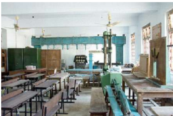
Structural Engg. Lab.