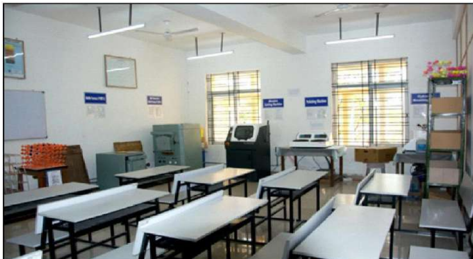
Physical Metallurgy Lab.

B.Tech. in Metallurgy & Materials Engineering