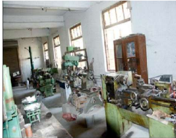
Production Engg. Lab.