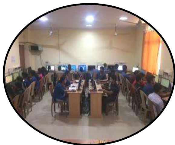
Computing Laboratory – II