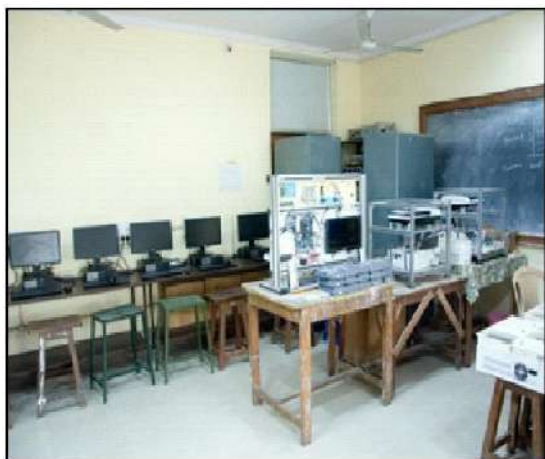
Computer Hardware Lab.