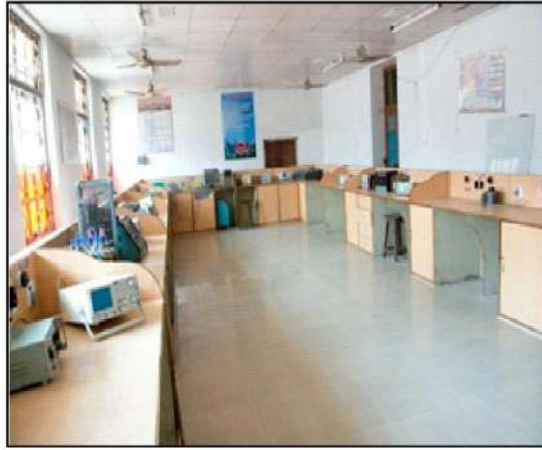
Electrical Machines Lab. Power Electronics Lab.