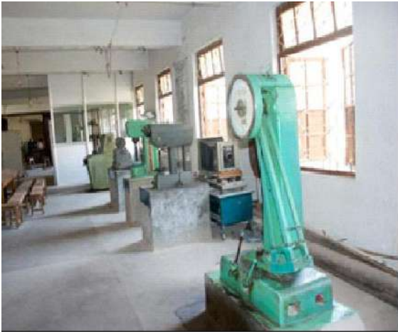
Materials Testing Lab.